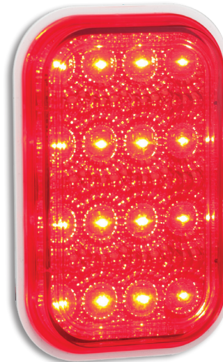
Stop/Tail 131RM - Single Blister

Approvals Function Category CRN ADR Stop/Tail 49/00 CTA-046431 ADR Indicator 6/00 2a CTA-046430 ADR Reverse 1/00 CTA-046432